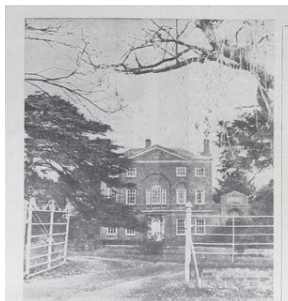
The magnificent Church Langton rectory.