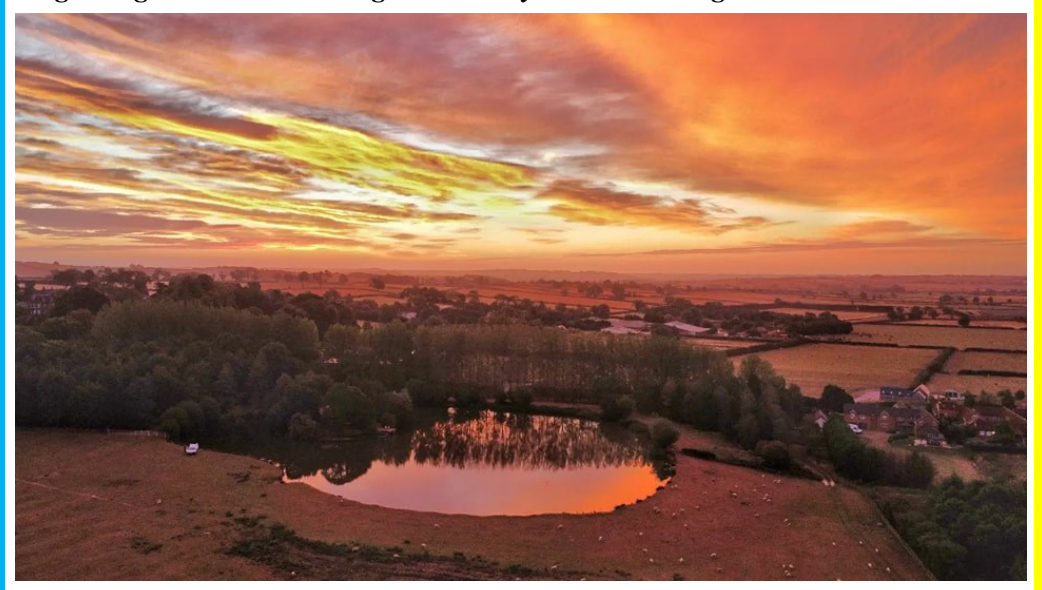
Sunrise Over East Langton Fishing Lake